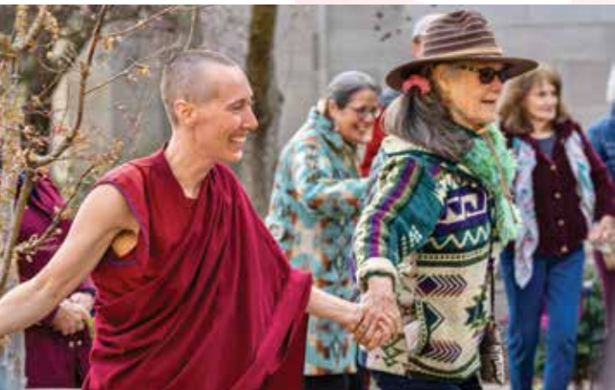
Abbey monastics join in an interfaith Vigil for Healing Earth's Waters in Spokane.

In addition, Abbey monastics gave dozens of in-person and online talks, including visits to Singapore and Atlanta, GA, as well as in local cities: Spokane and Newport, WA and Sandpoint and Coeur d'Alene, ID.